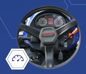
Easy to view instrument panel