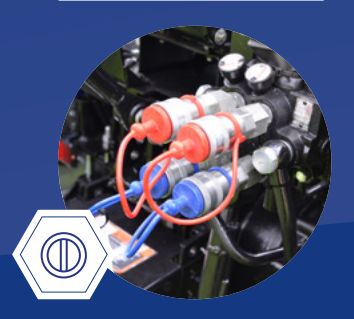
Rear mounted spool valves