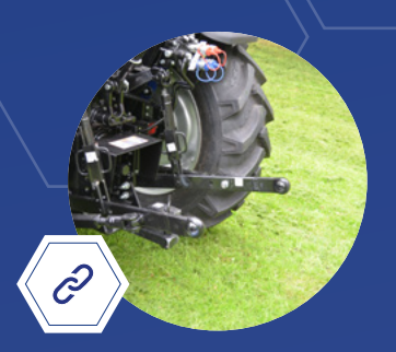
Rear three point linkage