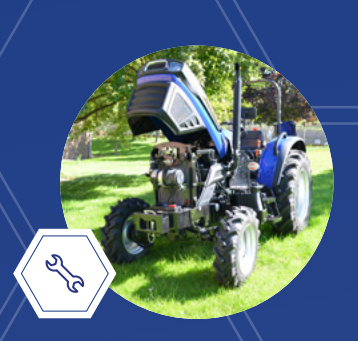
Simple service access